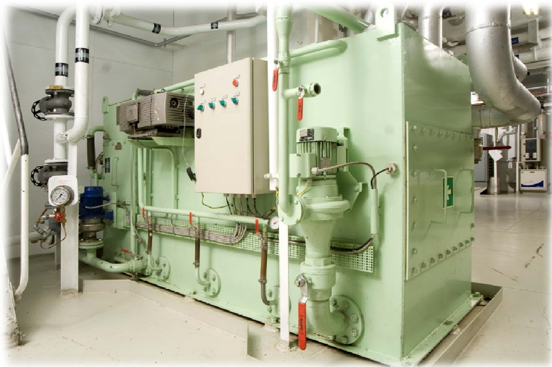
Installation onboard "Mary Arctica" owned by Royal Arctic Lines, dk